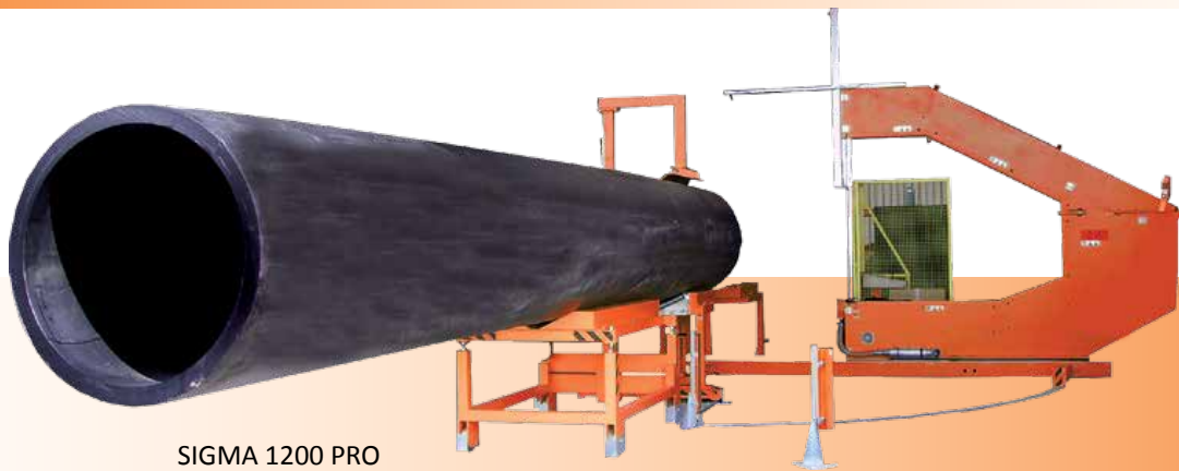
SIGMA 1200 PRO