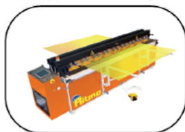
Types of welding

POLYFUSION 4-30 performs different types of weld horizontal, circular and 90° joints.