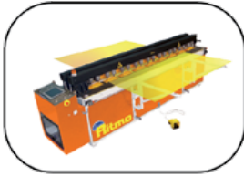
Types of welding