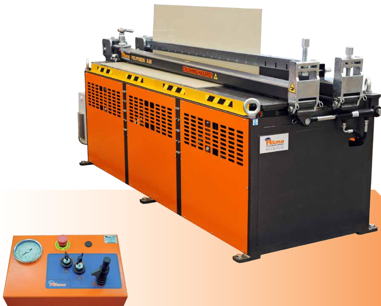
Manual Control Panel