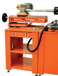
Reduced Tee Driller

RADIUS 40-315 machine for radial cutting