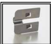
Weld seam slide cod 67205021