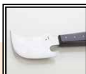
Quarter moon knife cod 67207010