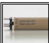
Heating element 230 V - 1500 W cod 57102007