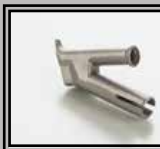
Speed welding round nozzle 5 mm cod 67205012