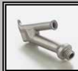
Round nozzle 4 mm with thread M10 cod 67205006