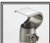
Shrink reflector cod 67205016