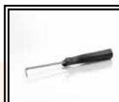
Seam tester cod 67207014