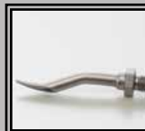
Tacking tip hooked with thread M10 cod 67205017