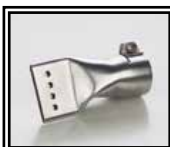
Flat perforated nozzle 40 mm cod 67204004