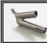
Speed welding triangular 5 mm cod 67205013