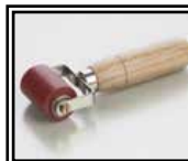
Pressure roller 2-armed 45 mm bearing mounted cod 67207000 cod 67206998