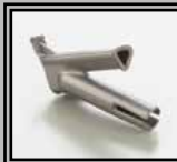
Speed welding triangular 5,7 mm cod 67205000