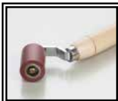
Pressure roller 1-armed 45 mm and 45° cod 67207006 bearing mounted cod 67206995