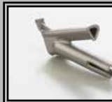
Speed welding triangular 7 mm cod 67205001