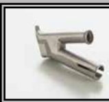
Speed welding round nozzle 4 mm cod 67205011