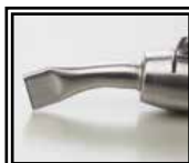
Flat nozzle 20 mm cod 67204002