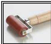
Pressure roller 80 mm bearing mounted cod 67207002 cod 67206996