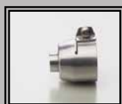
Adapter with female thread M10 cod 67204007