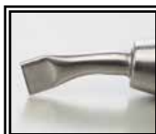
Flat nozzle 20 mm 15° cod 67204215