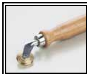
Pressure roller 5 mm for round wire cod 67207005