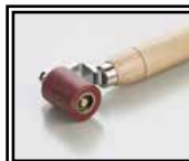
Pressure roller 1-armed 28 mm bearing mounted cod 67206994