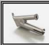
Speed welding round nozzle 3 mm cod 67205010