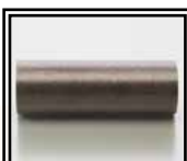
Insulating tube cod 57214011