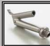
Triangular nozzle 5 mm with thread M10 cod 67205008