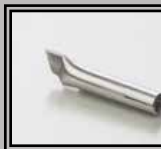
Tacking tip cod 67205015