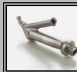
Triangular nozzle 7 mm with thread M10 cod 67205003