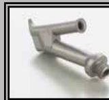
Round nozzle 3 mm with thread M10 cod 67205005