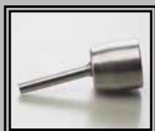
Round nozzle 5 mm cod 67204000