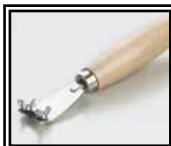
Grooving tool cod 67207011