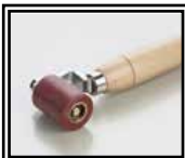
Pressure roller 1-armed 45 mm bearing mounted cod 67207001 cod 67206997