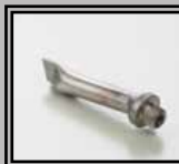
Tacking tip with thread M10 cod 67205004