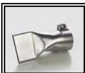
Flat nozzle 40 mm cod 67204003