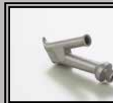
Round nozzle 5 mm with thread M10 cod 67205007