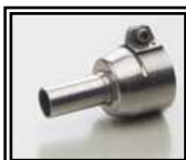
Shrink round nozzle 15 mm cod 67204005