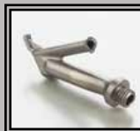
Triangular nozzle 5,7 mm with thread M10 cod 67205002