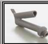
Triangular nozzle 7,5 mm with thread M10 cod 67205009