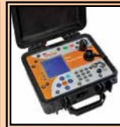
The INSPECTOR Data-logging