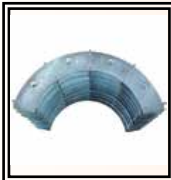
Inserts Ø 280 ÷ 560 mm