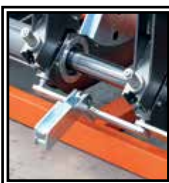
Detach device for heater