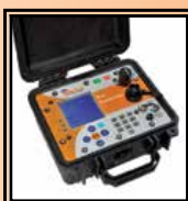
The INSPECTOR Data-logging