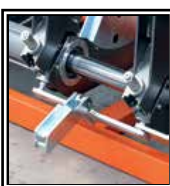
Detach device for heater