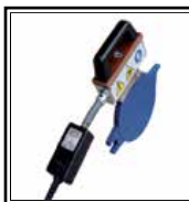
Heating plate with Digital Dragon