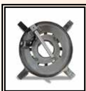
Tool for flange necks