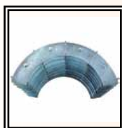
Inserts Ø 63 ÷ 180 mm